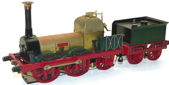
1:30 scale brass replica of the Titfield Thunderbolt

An upcoming sale of some top-end model trains has boys of all ages all steamed up.