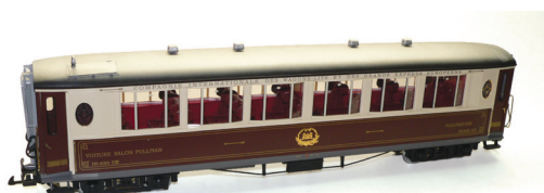
Passenger coach from the LGB Gauge-1 Orient Express set

This train was built up from a kit and like several sourced from the main vendor, has never been fired up. Estimates are $2000 to $3000.